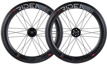
A D406 C46 - 12K