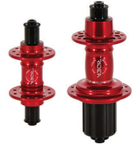
C HF1 F/R :20/24H