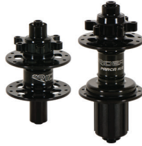
A HF2 PARCA F/R :24/24H

Precise CNC machined Ridea hubs and exclusive carbon rims make the perfect combo for your special Birdy bike.