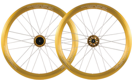
C D406 A33