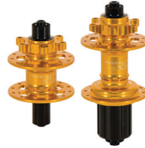
B HF2 F/R :24/24H