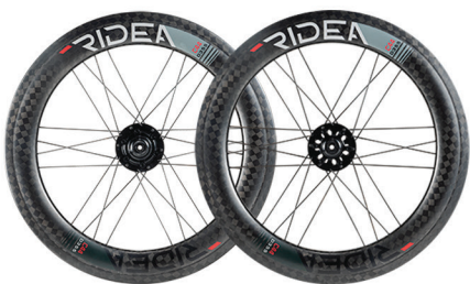
D D355 C44 - 12K