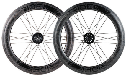
B D406 C46 - Forged